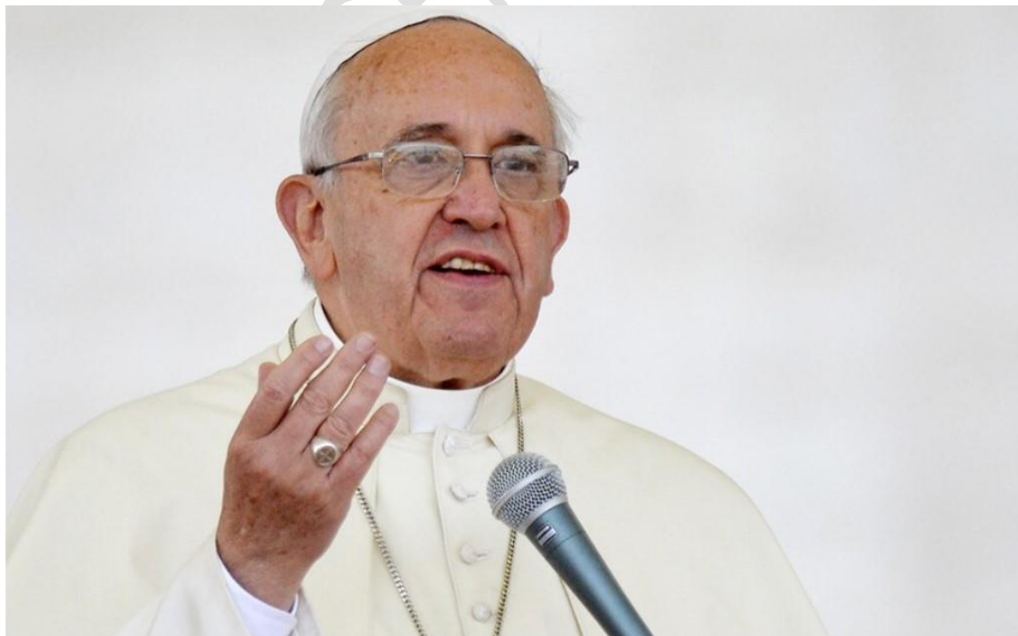
On May 10, 2014 Pope Francis also backed the campaign on Twitter calling for followers to pray for the girls' release.

On Wednesday, May 7, 2014, Michelle Obama added her voice to worldwide calls for the safe return of the girls. The First Lady tweeted: 'Our prayers are with the missing Nigerian girls and their families. It's time to #BringBackOurGirls.' The tweet was signed "-mo," indicating that she sent it herself.