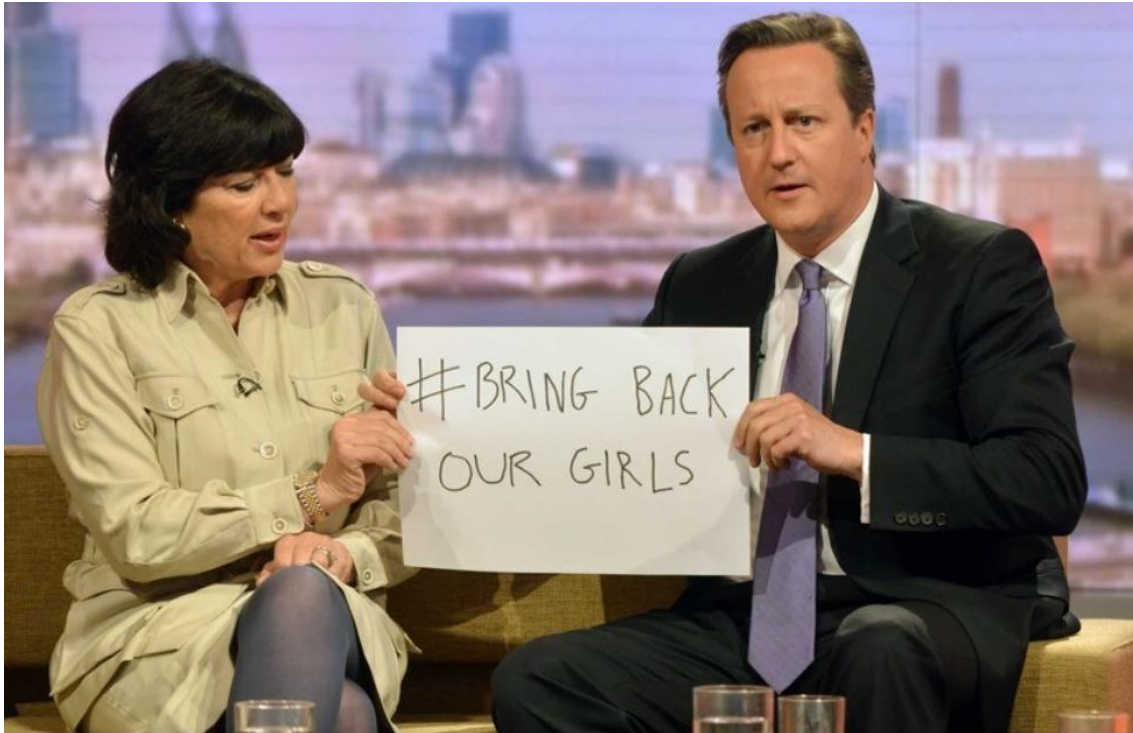
On May 11, 2014 David Cameron joined CNN's Chief International Correspondent Christiane Amanpour to support the social media campaign to free the six schoolgirls kidnapped in Nigeria. During The Andrew Marr show the Prime Minister said he did not rule out the possibility that British troops could be used to help rescue the girls.